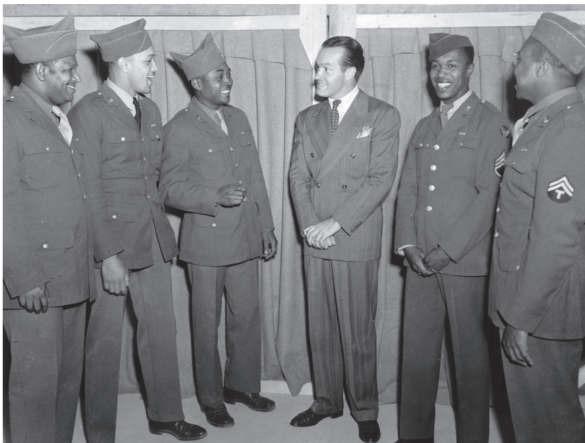
Bob with Tuskegee Airman, USO Tour, 1943, England.

After the war, Bob continued his commitment to making sure our GIs would never be forgotten in war . . . or in peace.